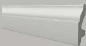
479101 PILLAR MOULDING