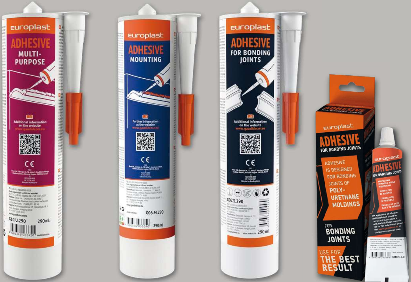
G10U290 290 ml