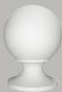
477101 BALL SHAPED CAP