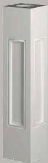
475101 COLUMN SHAFT