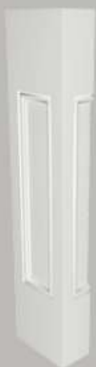
475111 HALF COLUMN SHAFT