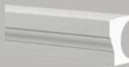
472111 HALF HANDRAIL