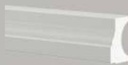
401131 HALF BASE