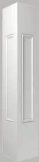
475201 COLUMN SHAFT