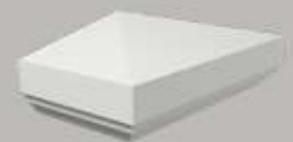
476211 PYRAMIDAL HALF CAP