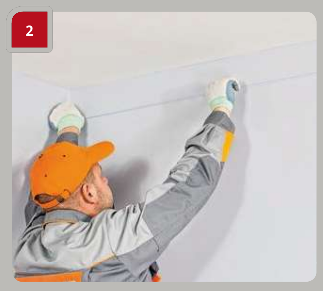
Using of chalkline connect the marks on the perimeter of the room.