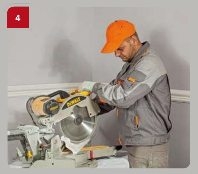
Using a mitre saw, cut out the element to the appropriate angle. In a room with 90° angles a mitre box or a handsaw can be used.