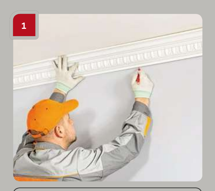
Firmly press the product to the wall and the ceiling, make a mark on the bottom edge of the product.